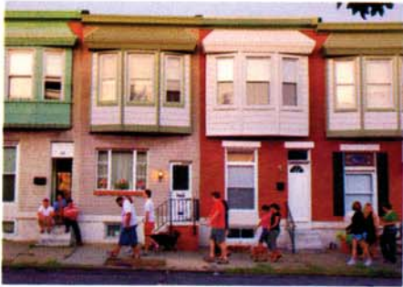
Patterson Park is a neighborhood of row houses and front stoops.